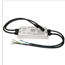
31041730 RGBW RF controller WP 4 channel (0.35A each CH)