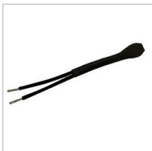
11015 Terminating Resistor